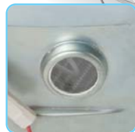
Sight Window to Combustion Chamber