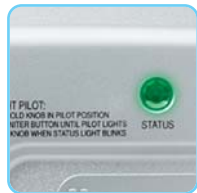
Gas Control Valve with Exclusive GREEN LED Indicator