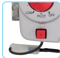
Integrated Piezo Igniter